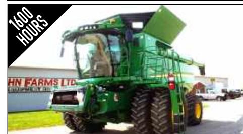
JD S780, 4wd, power bin, ActiveYield