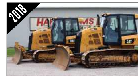
Cat D4K2 LGP, Cat D5K2 XL