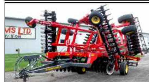
Sunflower 6631 24' VT, rear crumbler