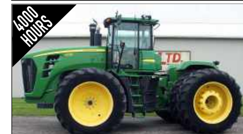
JD 9230, Powershift, 1000 PTO