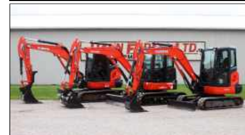
Kubota KX040-4, U55-5, KX057-4