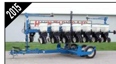
Kinze 3500 8/15 Planter