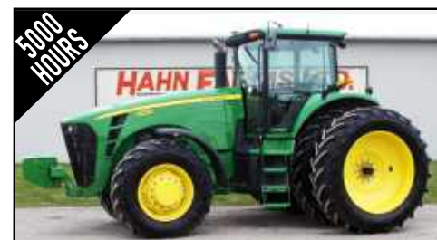
JD 8230, Powershift, 60 GPM

DUE TO EARLY BROCHURE PRINTING, THIS LISTING IS SUBJECT TO CHANGE. MANY LARGE PIECES WILL ARRIVE AFTER PRINTING. PLEASE CHECK OUR WEBSITE FOR ADDITIONS AND DELETIONS.