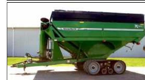
Unverferth 1115 Grain Cart