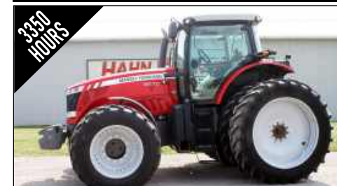
MF 8670, Dyna-VT, 5 remotes